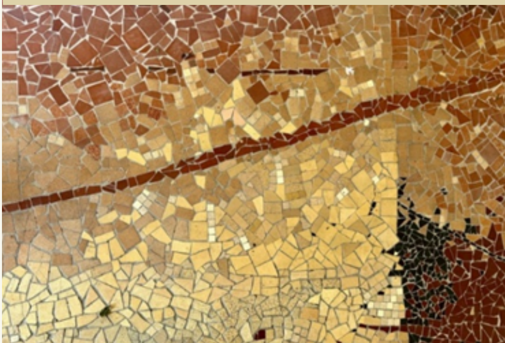
Image: Margo Lewers, 'Untitled' c. 1956, Penrith Regional Gallery Collection

Piece by Piece presents a site-wide exploration of the idea of the mosaic – the practice of creating something line by line, stitch by stitch, or piece by piece. Figurative and conceptual approaches to the mosaic technique are explored with new works by emerging artists exhibited alongside major examples by artists such as Rosalie Gascoigne, Esme Timbery and Rashid Johnson.