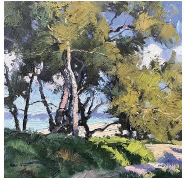
Warwick Fuller White Sands of Callala Bay, 2017 oil on canvas, 30 x 30cm Courtesy of Mary Bergin and Alan Amos Photography by silversalt