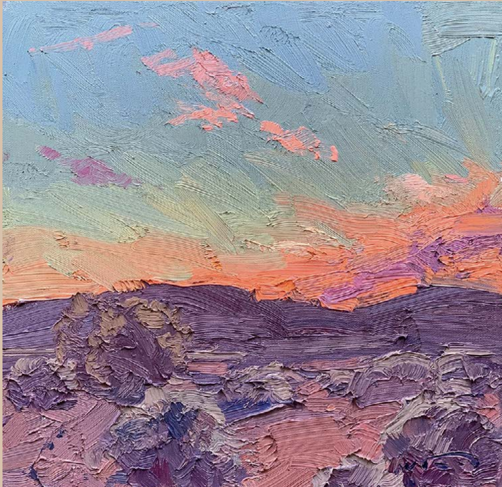
Desert Epilogue, Silverton 2019 oil on canvas 30 x 30cm