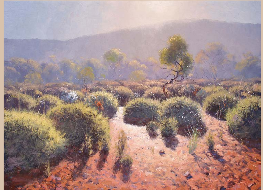
(Sketch for) Spinifex in Morning Light, Tom Price 2011 oil on canvas 90 x 120cm

In (Sketch for) Spinifex in Morning Light, Tom Price, 2011 , we enter the landscape with red dirt and small scattered rocks at our feet, so evocatively painted we wouldn't be surprised to look down and see red dirt dusting our toes. Then, as we lift our gaze, our eyes move through the landscape: across mounds of spinifex grass which is perfectly adapted to thriving in hot, arid conditions; onto gnarly, stunted trees hunkering in the mid-ground; with distant mountains rendered