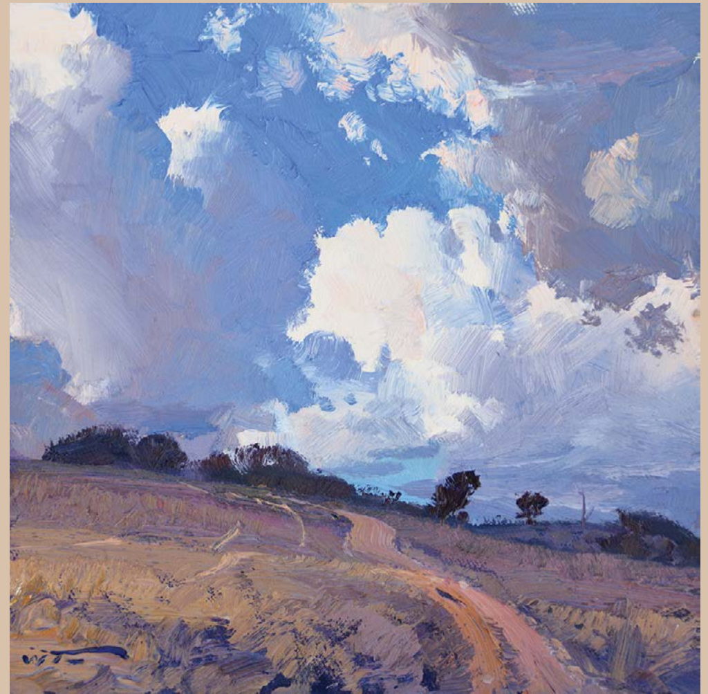
Blustery Morning near Yass 2012 oil on canvas 30 x 30cm