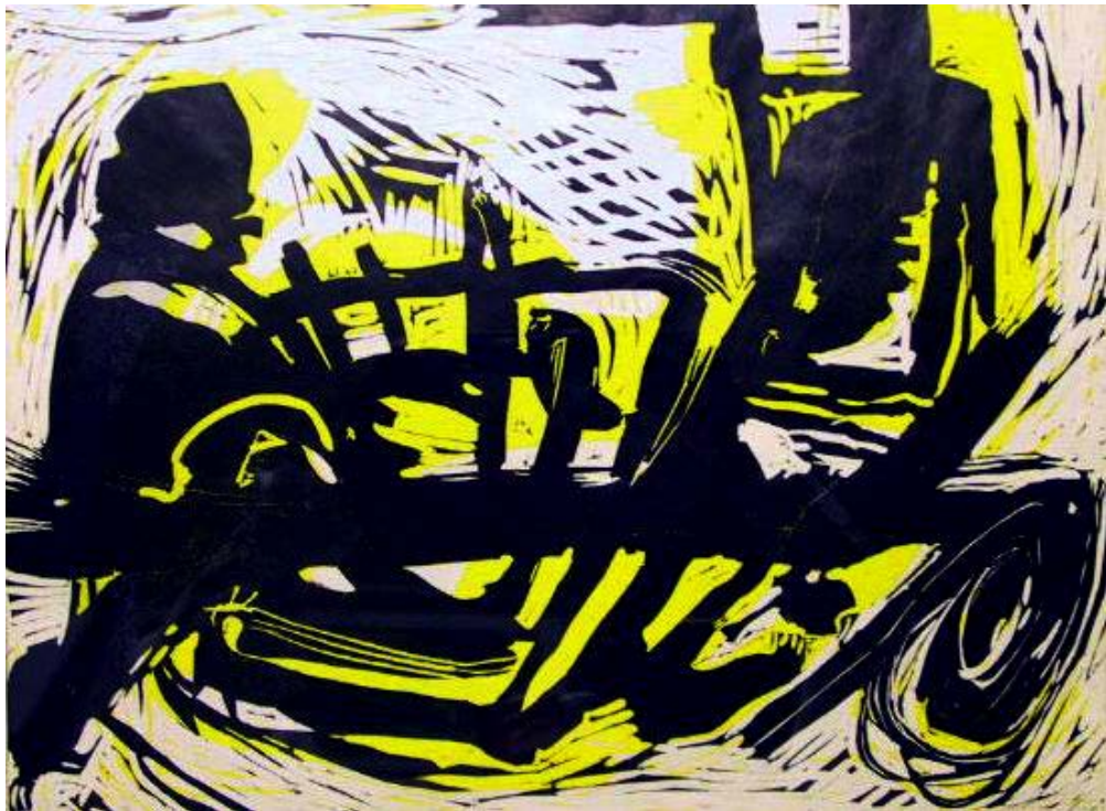
Eva Kubbos Shifting from Dark to Light 1962 coloured linocut 37.5 x 49cm Penrith Regional Gallery Acquisitions Fund, 1990 Copyright courtesy of the Artist