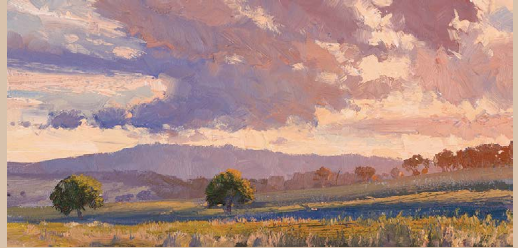
Wongarbron Sunset 2015 oil on canvas 30 x 60cm