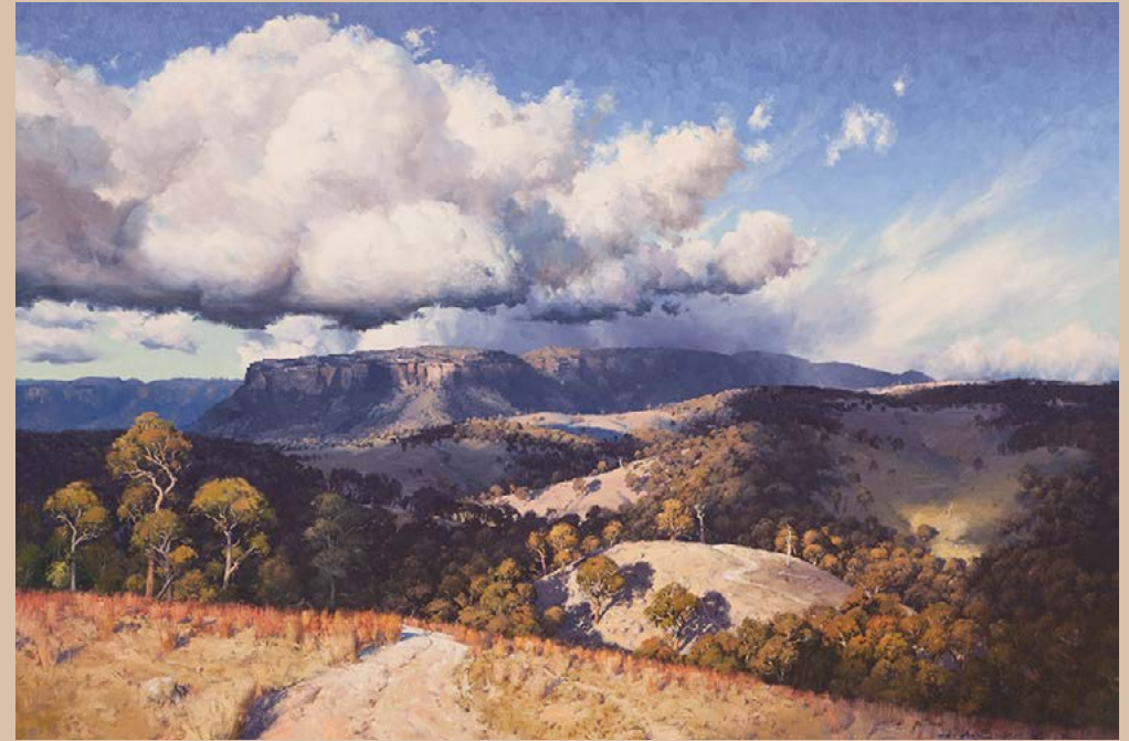
Into the Mystic, Kanimbla Valley