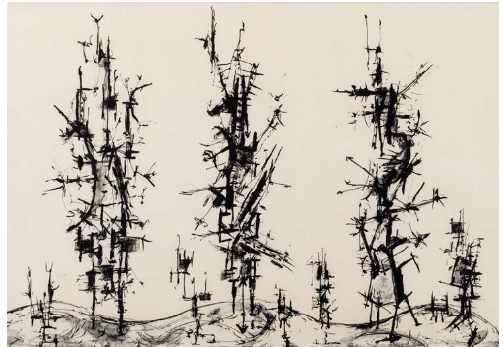
Robert Klippel Structures in a Landscape 1965 lithograph 54 x 78 cm (image) Penrith Regional Gallery Acquisitions Fund, 1991