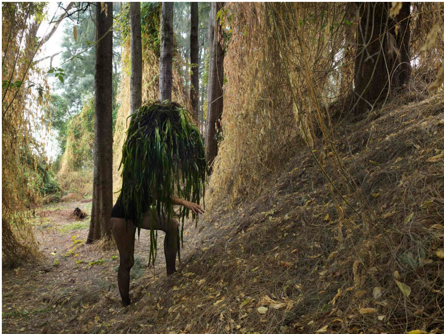
Nicole Monks with Luke Butterly (collaborative photographer) Native to this land 2017 Series of 10 c-print on custom wood, edition 1 of 6 +2AP 18 x 24 in (per image) Courtesy of the artists