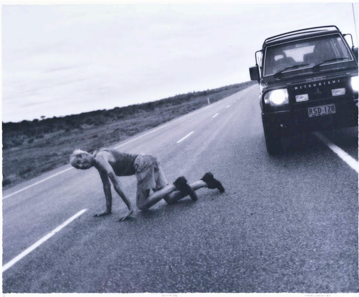
Tracey Moffatt Up in the Sky #4 1997 offset print 61 x 76 edition 15 of 60 Copyright courtesy of the artist and Roslyn Oxley9 Gallery, Sydney