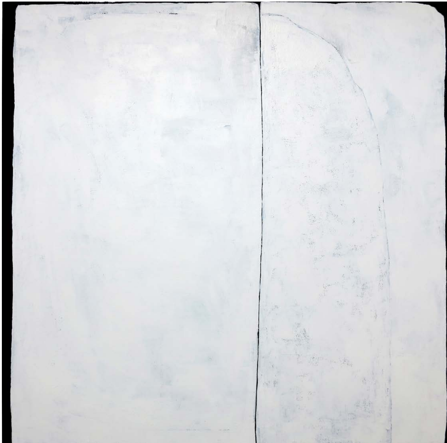
Hayley Megan French Eight vertical perspectives I 2017 acrylic on canvas 102 x 102