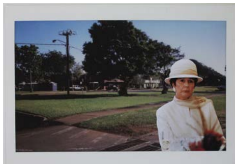
Alana Hunt Between me and you 2017

series of 15 images collage on enlarged polaroids printed on canson edition etching rag and mounted on aluminium 37 x 29 (per image)