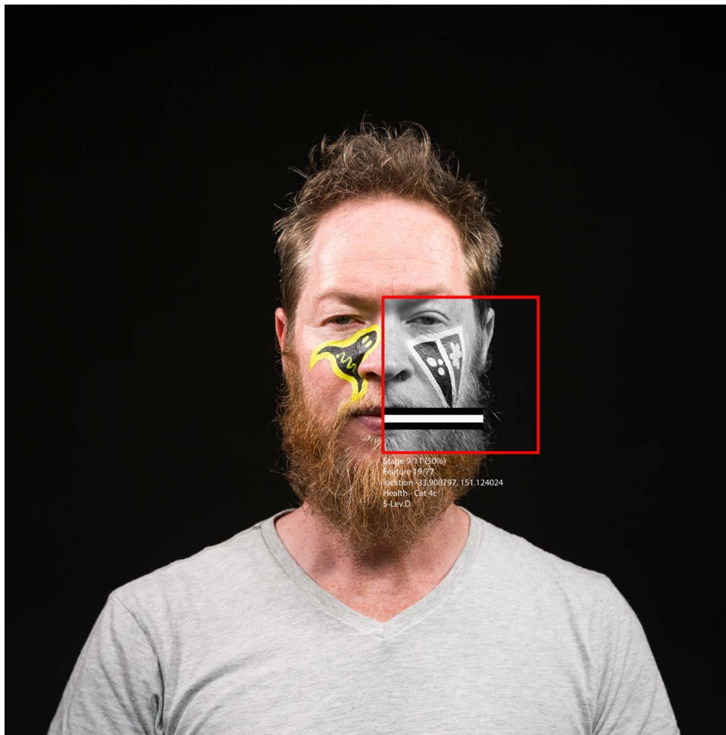
Jason Wing Brute Force >> Merge Sort >> 2017 video installation dimensions variable