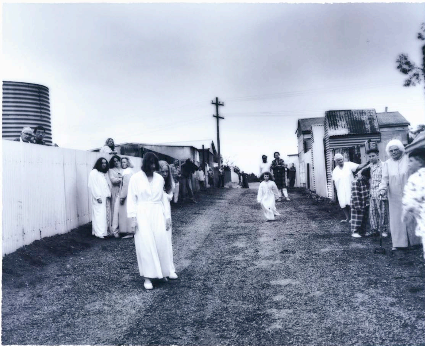
Tracey Moffatt Up in the Sky #15 1997