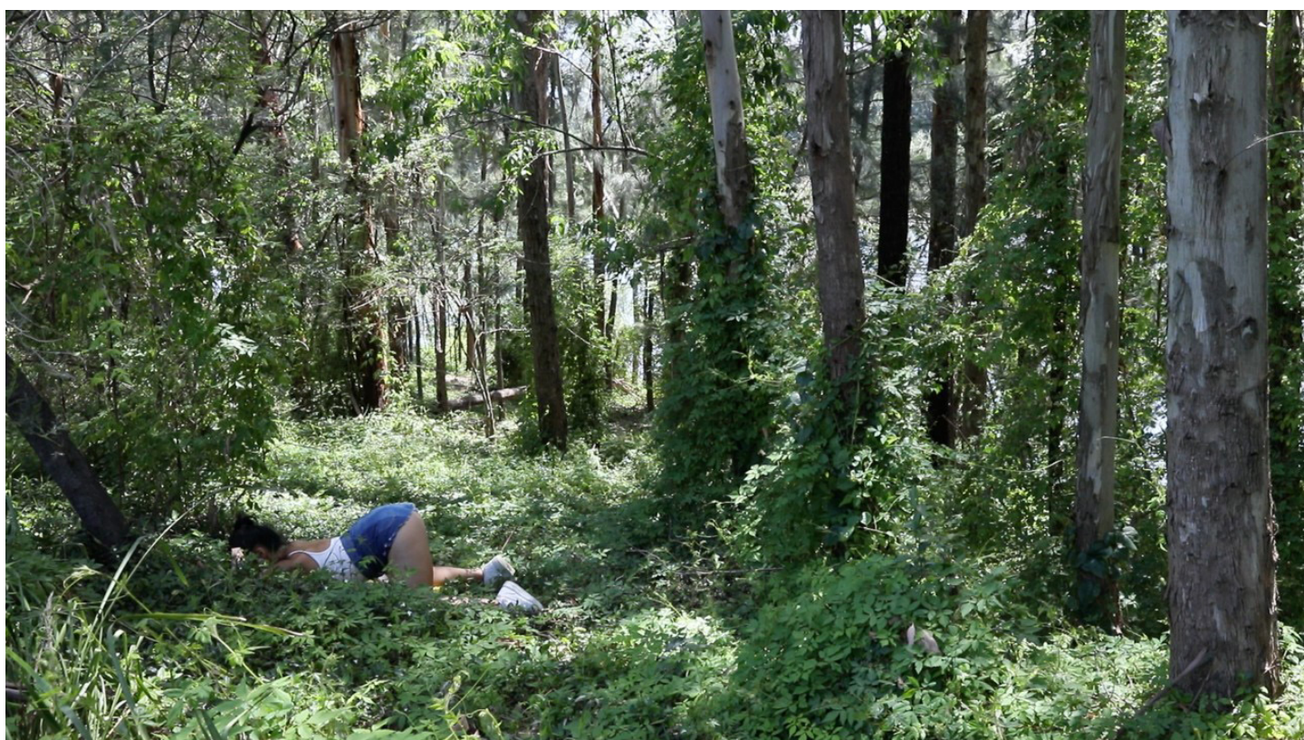
Caroline Garcia Pon de River / Pon de Bank 1 2017 lenticular photograph 42 x 29.7