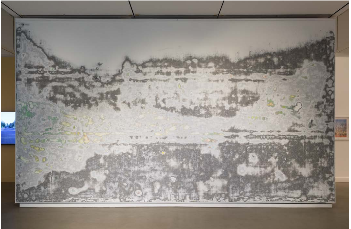
Carla Liesch Time Prolapse 2017 trace of past labour on gallery wall 600 x 350