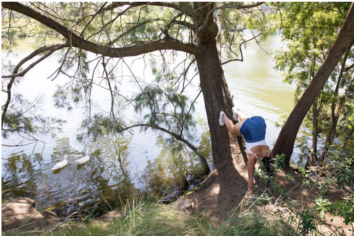
Caroline Garcia Pon de River / Pon de Bank 3 2017 lenticular photograph 42 x 29.7 Courtesy of the artist