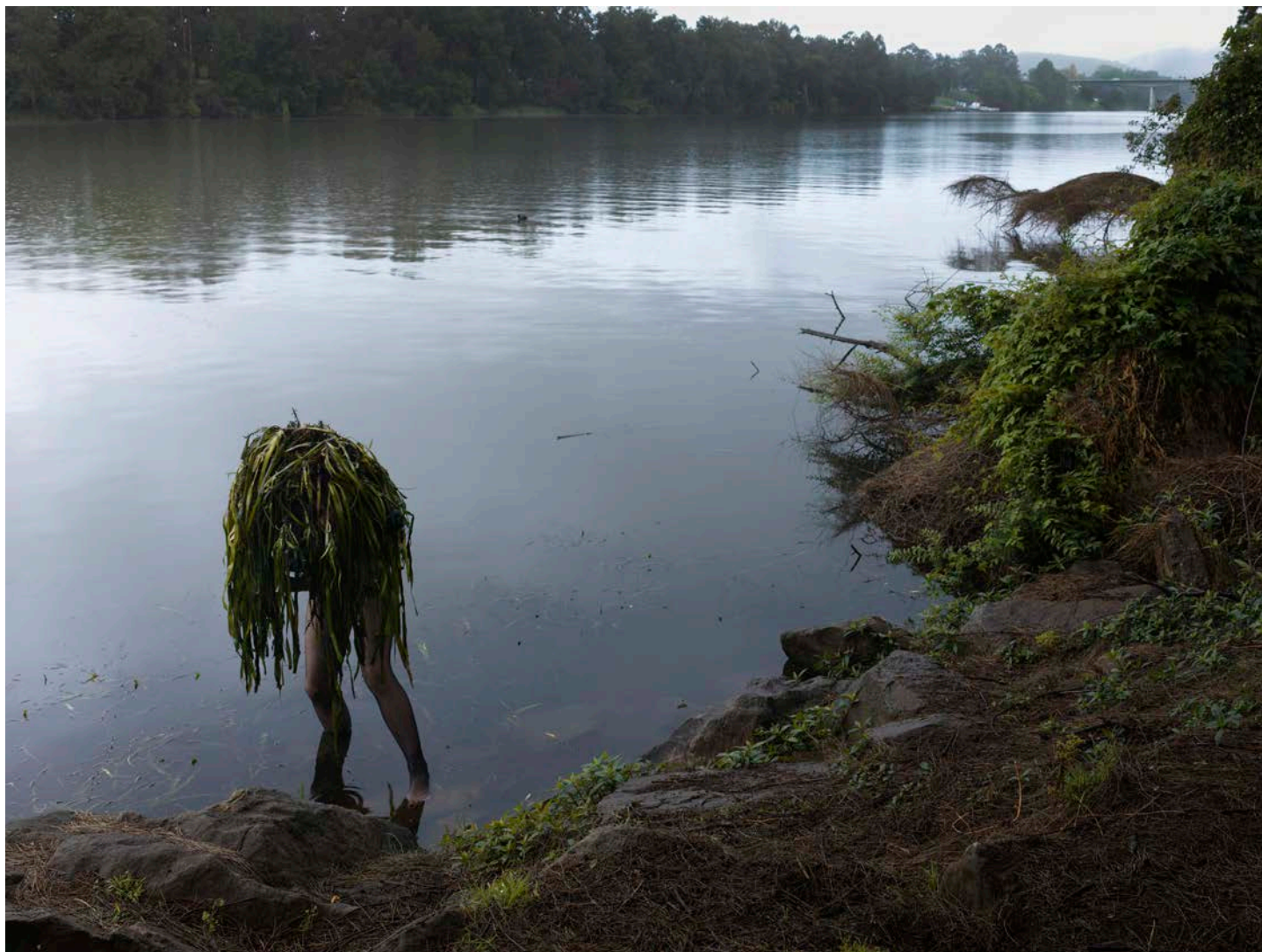
Nicole Monks with Luke Butterly (collaborative photographer) Native to this land 2017 Series of 10 c-print on custom wood, edition 1 of 6 +2AP 18 x 24 in (per image) Courtesy of the artists